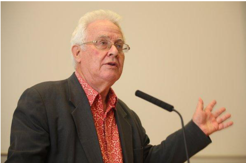
Fig. 3. Benedict Anderson, best known for his 1983 book Imagined Communities , which explored the origins of nationalism; https://www.nytimes.com