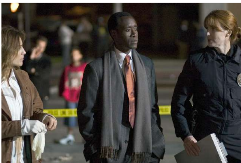
Figure 3. Officer Johnson (Kathleen York) provides a report on an officer shooting to Detective Graham Waters (Don Cheadle) and his partner Ria (Jennifer Esposito). A series of random events highlighted by an opening collision where Detective Waters and Ria were involved will culminate in another vehicular accident toward the end of the narrative in Crash (directed by Paul Haggis, 2004).

element in writing fiction is your ability to master transitions. [A multi-narrative film] turns out to be such a cinematic idea. You can cut from a radical cleric addressing disaffected young people to a massive yacht in the Mediterranean. There is a lot of power in those juxtapositions”). A later Times article reviewing a recent release, Ray Lawrence’s Jindabyne , closes with a reference to “the kind of multi-stranded narrative that has become... the dominant genre of international prestige filmmaking” (Scott).