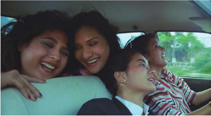
Figure 7. The women in Marilou Diaz-Abaya's open-ended Moral (1982): former college chums and now grown-ups with their share of joy, heartbreak, and trauma, bring their friend (seated front beside the driver) to the airport where she plans to migrate to the US.

Lee also continued his scriptwriting assignments for Bernal, collaborating on the Regal Baby project Are These Our Children? (Ito Ba ang Ating mga Anak? 1982). The attempt to ascribe Third-World angst and ennui to middle-class youngsters begged a comparison with the genuinely subversive exposés of Manila by Night , the more recent project paling in comparison. As a result, Bernal's and Lee's subsequent projects— Affair and Miracle (Relasyon and Himala respectively), each starring one or the other of the country's rival top stars, and both released in 1982—observed the traditional linear-heroic narrative format and won box-office and critical acclaim.