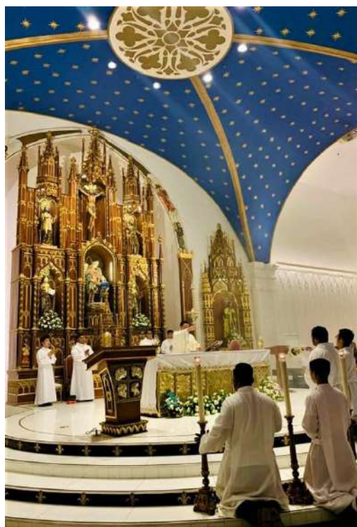
Figure 4. The retablo behind the altar and Mass assemblage, at the Chapel of the Holy Guardian Angel at the Holy Angel University in Angeles City, Pampanga Province.

local audiences to look front and upward while seated in rows in regular attendance, one need only replace altars with screens in order to complete the analogy. The element of multiplicity comes in when we consider the spectacle available in the major traditional churches: the retablos (see Figure 4), or altar pieces, reminiscent of Mexico, where “the foci were the niches containing the santos [icons of the saints]” (Javellana 156).