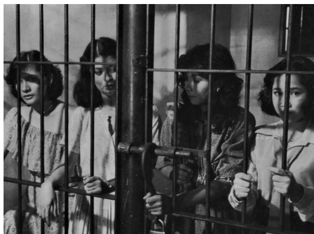
Figure 6. Four of the six women characters in Ishmael Bernal’s Underage ( Menor de Edad , 1979; another Filipino film with the English title Underage , also with multiple women characters, came out in 1980). The release print was forced to append a textual coda (opening awkwardly with “Having lived through these restless years, the menor de edad found the right way to adulthood,” translated by the author); observers could readily deduce that it was imposed by the Board of Censors for Motion Pictures, which then comprised military personnel and their underlings. Inadvertently such an ending made the film reminiscent of an earlier Hollywood release, George Lucas’s American Graffiti (1973).

With the triumph of Pleasure as both a commercial attempt and a triple-character narrative, Bernal effectively ushered in an era of multiple-character film production in the Philippines—a mode of practice that complemented the studios’ and talent managers’ strategy (recapitulating the Stars ’66 tradition) of launching new stars in identifiable batches. Bernal immediately followed through with increasingly larger numbers of lead characters— Underage ( Menor de Edad , 1979—see Figure 6) with six women and Manila by Night with 13 lead individuals. Although the “smorgasbord” term was no longer in vogue, producers, practitioners, and critics began to use the term “milieu movie” to refer to the multicharacter format. A specialized area of application, drawn from the “city film” properties of Nashville , Manila by Night , and a few other samples from global cinema may be induced from the generic recognition and “milieu” terminology used by progressive Philippine artists.