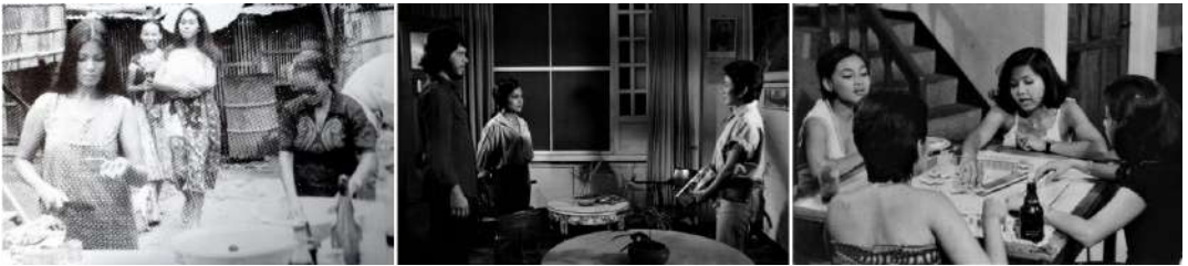
Figure 5. Three triple-character exercises from Ishmael Bernal (left to right): Mole on the Water (1976), a male-centered love triangle where the man recedes from the conflict he created before returning to resume his responsibilities; You Are Mine (1978), another male-centered love triangle where the man persuades his lovers to arrive at an understanding between them; and Pleasure (1979), where the male figures become secondary to the concerns of nightclub workers.

From this point onward, Bernal began introducing destabilizing elements to his love-triangle assignments, such as banishing the central male character in Mole on the Water ( Nunal sa Tubig , 1976) or allowing all three to accept a polyamorous arrangement in You Are Mine ( Ikaw Ay Akin , 1978). With a triple-character hostess film assignment in Pleasure (1979), Bernal managed to interweave the women's narratives without favoring any single individual as exemplary or as representative of the others. Instead of having each character's story unfold one after the other (per the standard episodic "hostess movie" procedure), the filmmaker could maximize their interactions in their workplace and resist favoring any one of them (see Figure 5). Each of the characters (the minimum of three) could have a series of lovers as a requisite of her profession; but with the narrative constantly returning to the working woman, none of the relationships needed to be valorized over the others. With Bernal's literary background, he was still able to devote some attention to characterization so that the central "hostesses" in Pleasure manage to have distinctive (if standard) developments. Their individual resolutions build up to a variation on the personal-as-political principle, where their private and professional concerns overlap, and require a benevolent dressing-down from their nightclub manager.