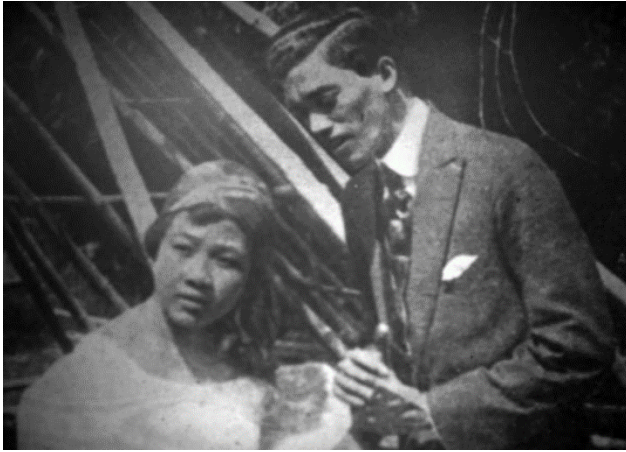
Figure 1. A scene from Country Maiden (directed by Jose Nepomuceno, 1919). In Manila Nueva , 13 Sep. 1919, from Tofighian (79).

Understandably, Philippine film practice paralleled structures and trends observed by the US during the Classical Hollywood period, and allowed itself an increasing measure of non-US global influence at roughly the same moment that the US yielded to the libertarian and technical changes wrought by European art cinema, from the 1960s onward. By the end of the 1950s, the same vertically integrated system that was busted in the US by the decision, known formally as United States v. Paramount Pictures Inc. (334 US 131) or the Hollywood Antitrust Case, effectively ended an era dominated in Philippine practice since pre-War times by an oligopoly of three major studios. All three continued operating into the Second Golden Age, but were challenged by a glut of independent production companies, many of which were founded and run by stars headlining their own projects. 2